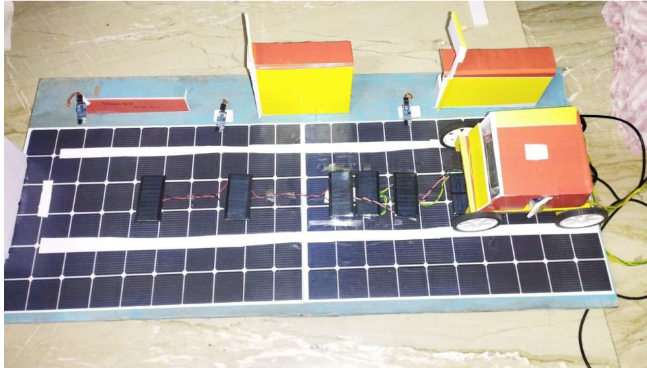
Fig: Railbus Model